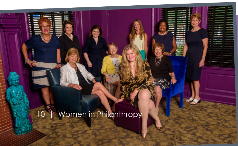
10 | Women in Philanthropy

In September 2018, Women in Philanthropy awarded five STEAM Stars scholarships to local high school students to cover the full cost of earning an associate degree (before they even finish high school!) through the Level Up Program at Lackawanna College.